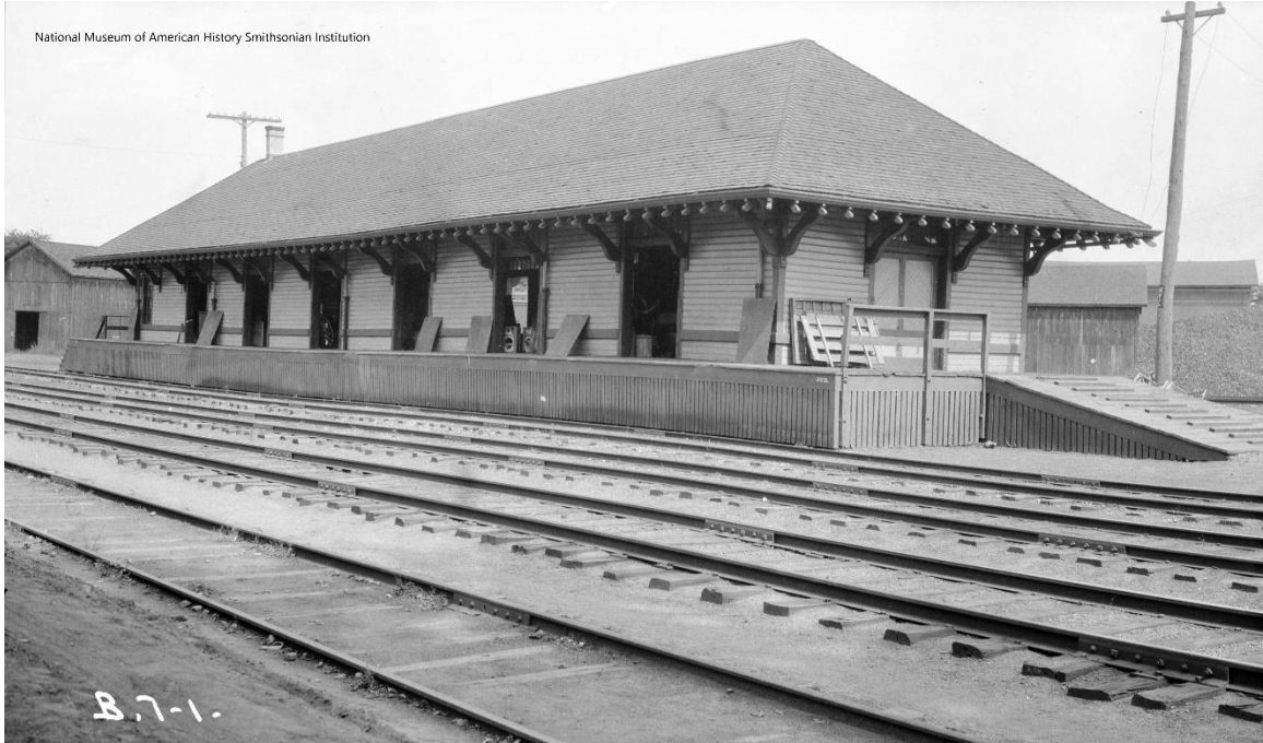
1916 Interstate Commerce Commission Valuation Photograph of New York Central Railroad Freight Station in Shortsville, New York (Southwest Side)