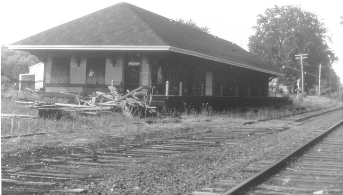
1970s Photograph of Shortsville Freight Station (Northwest Side)

The Shortsville freight station is located along a portion of one of the oldest and most historic railroad lines in New York State known as the "Auburn Road." This section started existence in the 19th Century as the Auburn and Rochester Railroad. It was chartered in 1836. Construction work was started in 1840 and was finished in 1841. The railroad line was operated by the New York Central, Penn Central, and Conrail railroads over the years and is currently operated by the Finger Lakes Railway.