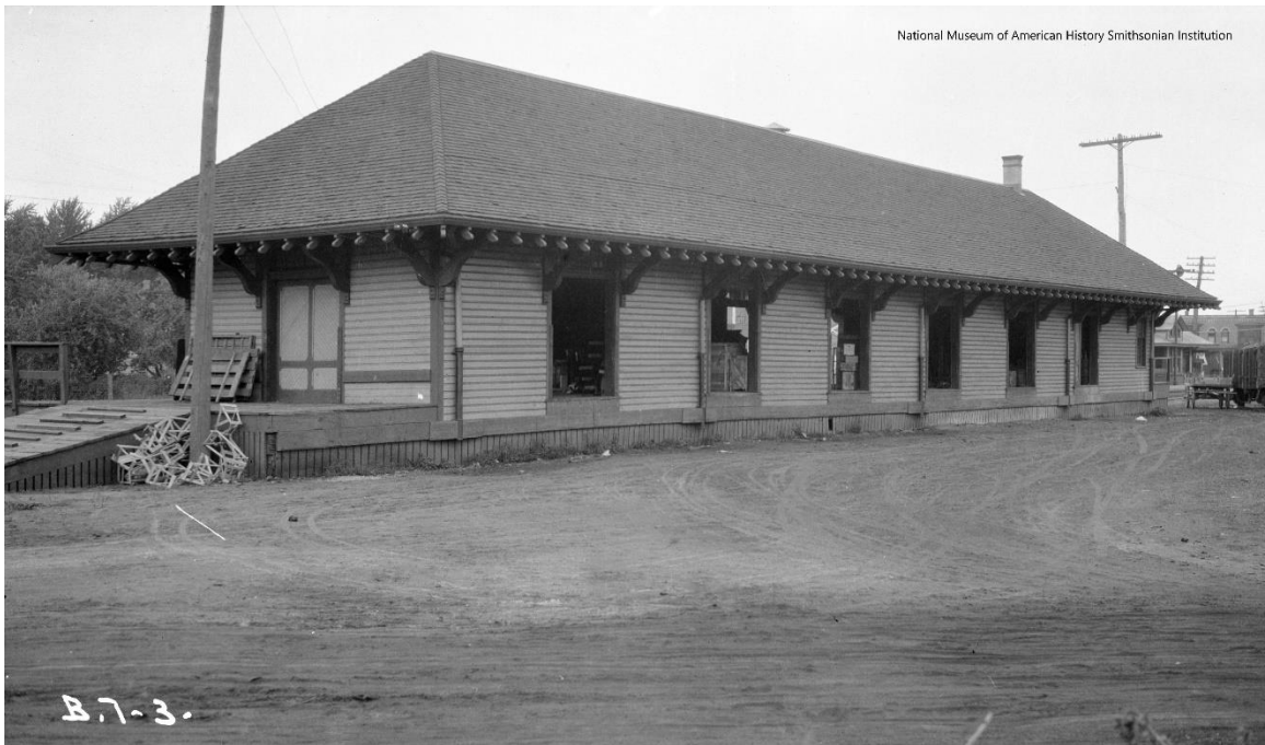
1916 Interstate Commerce Commission Valuation Photograph of New York Central Railroad Freight Station in Shortsville, New York (Southeast Side)