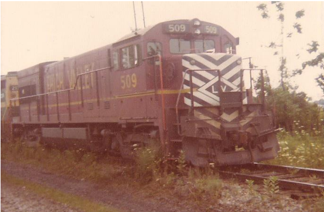
LV U23B #509 on Conrail's Corning Secondary north of Geneva, NY