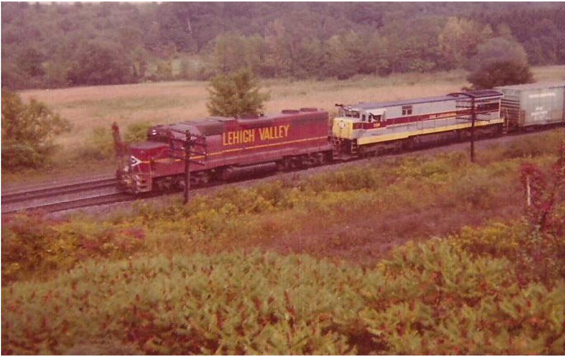
LV GP38AC #? leads an EL U-boat on a westbound Conrail freight train on the Chicago mainline at the Blue Cut between Lyons, NY, and Newark, NY. (Ken May – September 1976)