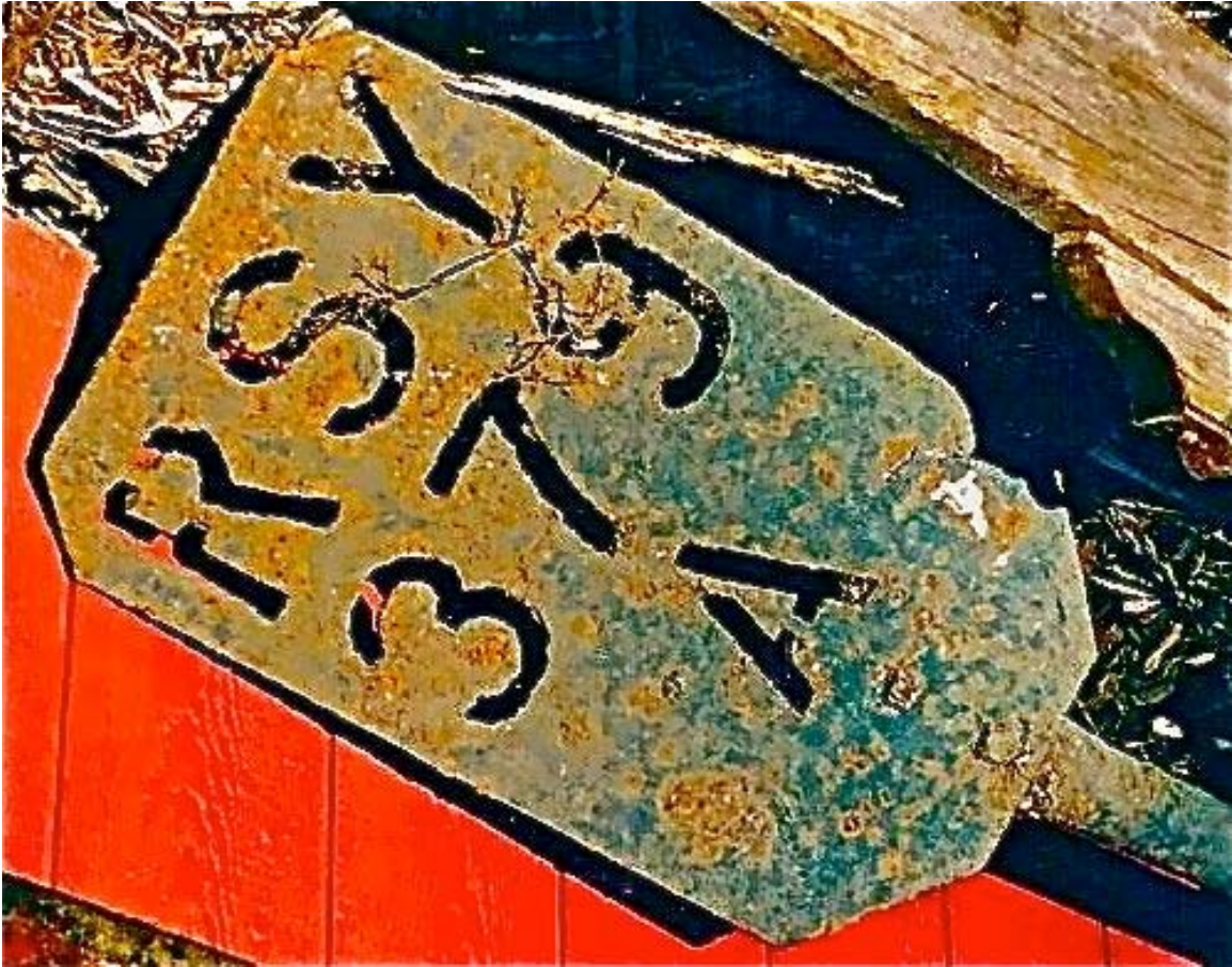
RSY 379 A Sign

There's still work to be done on the wye, especially the deck/railing installations that will provide safe passage over those bridges (formerly designated "RSY 379 A" and "RSY 379 B"). One of those signs, found buried under cinders by the writer, will grace the finished product, as trail users access the presently undeveloped Great Bend Park from either direction.