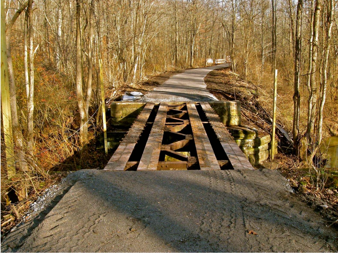
RSY A Bridge

The wye was a favorite place for adventuresome kids, who often walked the branch tracks from Honeoye Falls for a day's viewing of the LV's mainline of rolling thunder. For a railroad setting, either leg was bucolic, since, by the 1960s, passenger train service was gone and branch traffic usually amounted to five to ten short, slow freights per week. Mainline action, however, from New York to Buffalo via Mendon and Rush, Caledonia and Victor, still amounted to a couple dozen long trains per day.