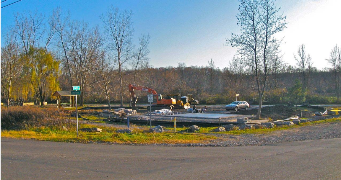
Freight House Work

Weeks transpired before I returned to the scene of my distress, now, of course, Mendon Foundation's Lehigh Valley Trail. As it turns out, the perceived bomb crater is blooming into a replica of the former freight house that was on the site.