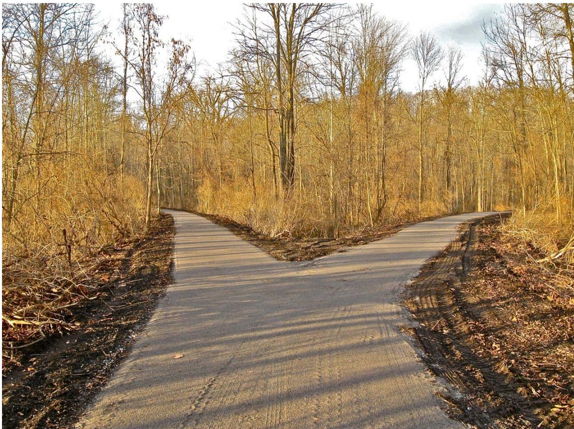
South Approach to Wye

For several years, only the westerly leg of the Y [wye], including its little bridge over Surrine Creek, was adapted to trail use. The other leg, flaring toward the east, was buried in brambles, with its two little bridges (each spanning about 30 feet) topped with dangerously rotted wooden ties (sleepers). Fresh stone dust has been laid down and the bridges cleared for new decking. Soon, the entire wye will be a full-fledged part of the Lehigh Trail. Hoooo-ray!